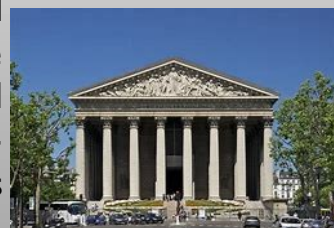
La Madeleine, Paris

Gabriel Fauré , was born May 12, 1845 in Pamiers, Ariège, France and died November 4, 1924 in Paris. He was a composer whose refined and gentle music influenced the course of modern French music. Fauré's musical abilities became apparent at an early age. When the Swiss composer and teacher Louis Niedermeyer heard the boy, he immediately accepted him as a pupil. Fauré studied piano with Camille Saint-Saëns, who introduced him to the music of Franz Liszt and Richard Wagner. While still a student, Fauré published his first composition, a work for piano, Trois romances sans paroles (1863). In 1896 he was appointed church organist at the church of La Madeleine in Paris and professor of composition at the Paris Conservatoire. In 1905 he succeeded Théodore Dubois as director of the conservatoire, and he remained in office until ill health and deafness forced him to resign in 1920. Among his students were Maurice Ravel, Georges Enesco, and Nadia Boulanger.