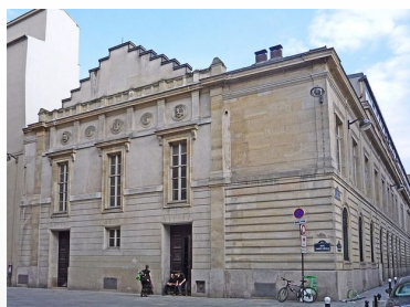
The Paris Conservatoire

Célément François Théodore Dubois , was born on August 24, 1837 in Rosnay, France and died on June 11, 1924 in Paris. He was a French composer, organist, and teacher known for his technical treatises on harmony, counterpoint and sight-reading. He studied under the cathedral organist at Rheims and at the Paris Conservatoire. In 1871 he succeeded César Franck as organist at the church of Sainte-Clotilde. In 1868 he was