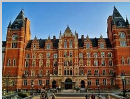
The Royal College of Music

Sir Charles Villiers Stanford , was born on September 30, 1852 in Dublin and died on March 29, 1924 in London. He was an Anglo-Irish composer, conductor, and teacher who greatly influenced a generation of British composers; Ralph Vaughan Williams, Sir Arthur Bliss, and Gustav Holst were among his pupils. Stanford studied at Trinity College, Dublin and Queen's College, Cambridge, and between 1874 and 1877 with Karl Reinecke in Leipzig and Friedrich Kiel in Berlin. He became professor of composition at the Royal College of Music in London in 1883 and professor of music at Cambridge in 1887. He also conducted the London Bach Choir (1885–1902) and the Leeds Triennial Festival Orchestra (1901–10). He was knighted in 1901. Stanford was a prolific composer and was especially known for his orchestral works, which include seven symphonies and five Irish Rhapsodies. His other works include numerous choral pieces, 10 operas, and many songs. His music reflects the late 19th-century Romantic style, into which he introduced elements of Irish folk song.